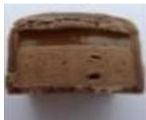
2. Mars Bar