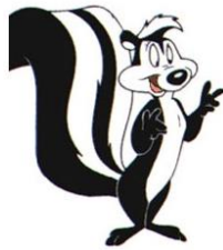
Pepe Le Pew