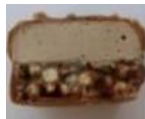
3. Double Decker