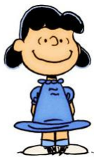
Lucy (Van Pelt)