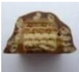
1. Lion Bar