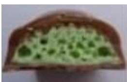
5. Mint Aero