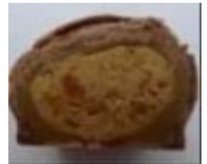
4. Star Bar